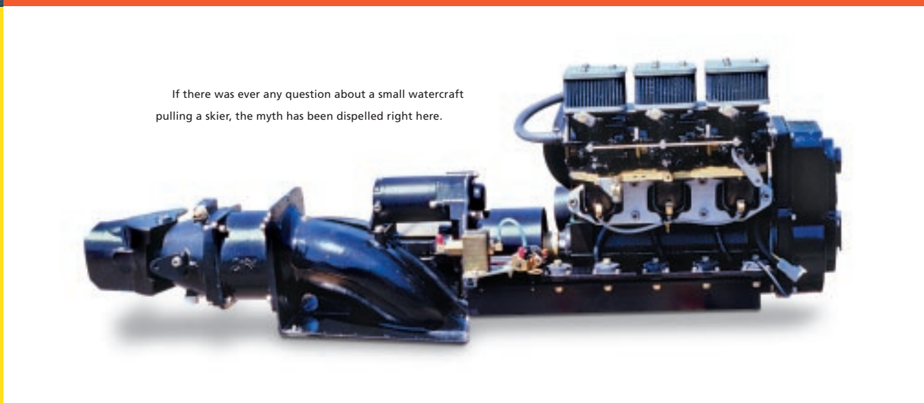
If there was ever any question about a small watercraft pulling a skier, the myth has been dispelled right here.

Solo Specifications Material: Fiberglass / Molded Plastic Length: 94.5" Width: 41.5" Height: 29" Weight: 375 lbs. Engine Type: 3 cylinder, 2 stroke Displacement: 683 cc Rated Power: 70 hp Propulsion: Jet Pump, Axial Flow Automatic Bilge: Constant Siphon Fuel /Oil Mix: 50:1 Fuel Tank Capacity: 6 U.S. Gallons