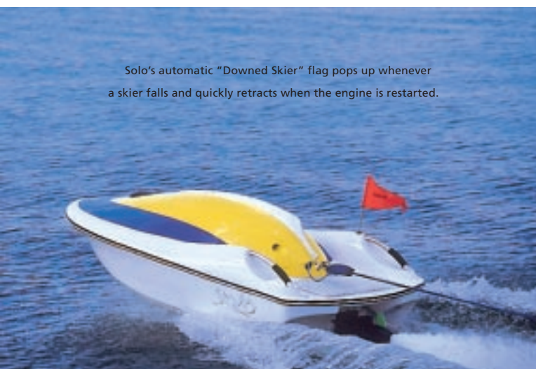
Solo's automatic "Downed Skier" flag pops up whenever a skier falls and quickly retracts when the engine is restarted.