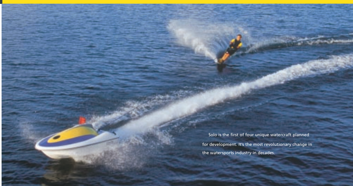
Solo is the first of four unique watercraft planned for development. It's the most revolutionary change in the watersports industry in decades.

For years, self-service water skiing and wake boarding has been only a dream. The desire for the power and control to be the driver, spotter and skier is now a reality. Solo is your own personal ski machine. Always ready whenever you are.